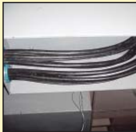
Conduit Pull Box